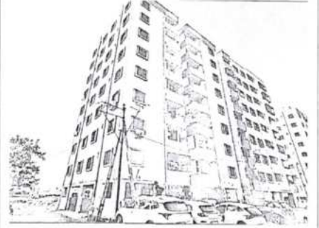
PHOTO OF THE PROPERTY

E-Auction Website: https://baanknet.com/